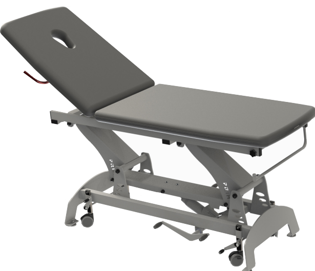
Two sections hydraulic treatment table