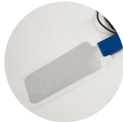
adhesive return plate