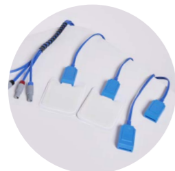
four-way multiplexed resistive electrode