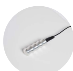
cylindrical resistive handpiece