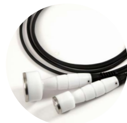
physio-aesthetic bipolar electrodes