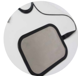
flexible stainless steel return plate