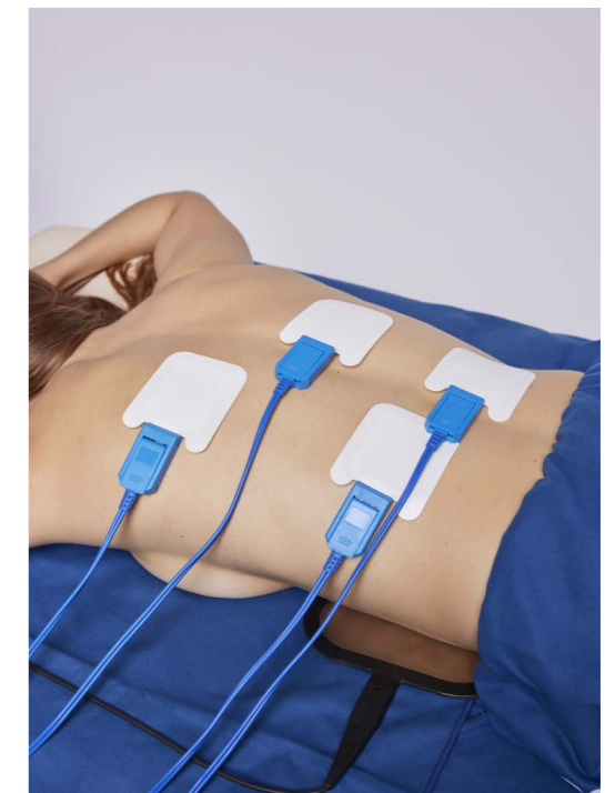
Treatment with four-way multiplexed resistive electrode and flexible return plate.