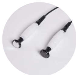
resistive and capacitive electrodes Ø 25 mm