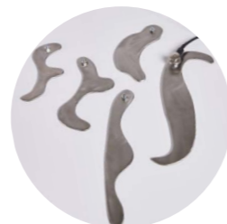
Manual Assisted Therapy Kit