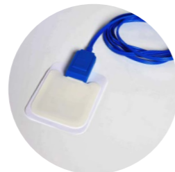
resistive functional electrode