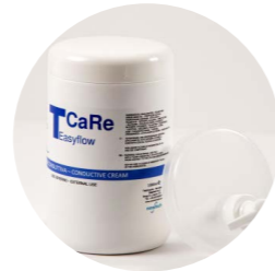
conductive cream 1000 ml