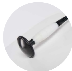
convex capacitive electrode