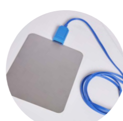
rigid stainless steel return plate